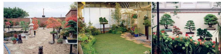
Above A collection from Bushuken Bonsai

The prestigious RHS Chelsea Flower Show opens this month and Essex exhibitors have been busy. Philippa Pearson discovers what's in store