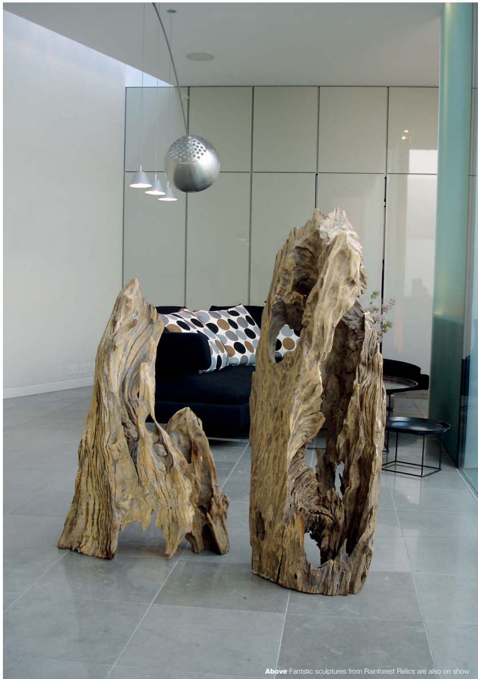
Above Fantastic sculptures from Rainforest Relics are also on show