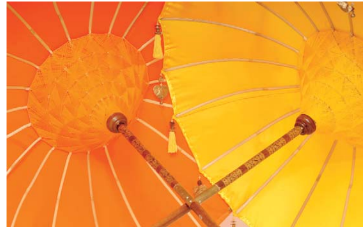
Above Balinese Parasols feature on East4West's exhibit Below Juicy strawberries from Ken Muir